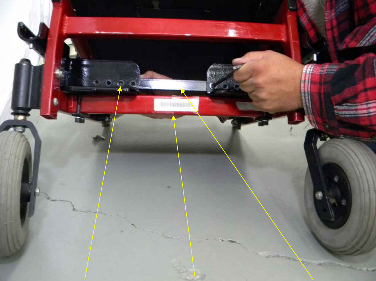
Crossmember Mounting Holes